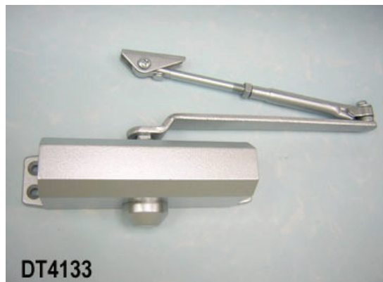
DT4133 DOOR closer for weight: 25-45kgs / 40-65kgs / 60-85kgs / 80-120kgs, Finish: Gold / Silver