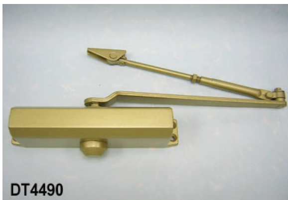
DT4490 Door closer for weight: 65-85kgs, Finish: Gold / Silver