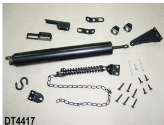
DT4417 Door Closer