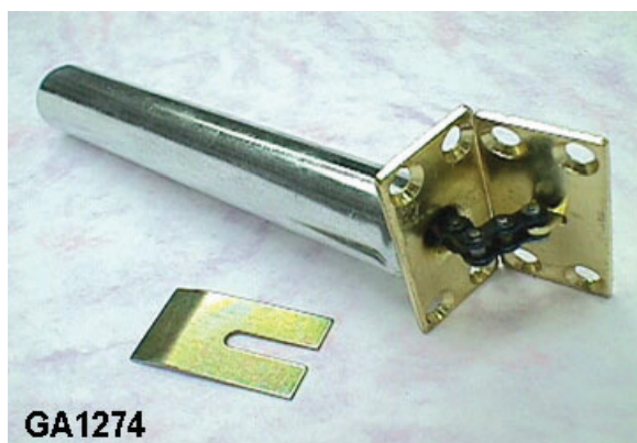
GA1274 Steel Chain Door Closer (BS EN1634-1:2000 approved)